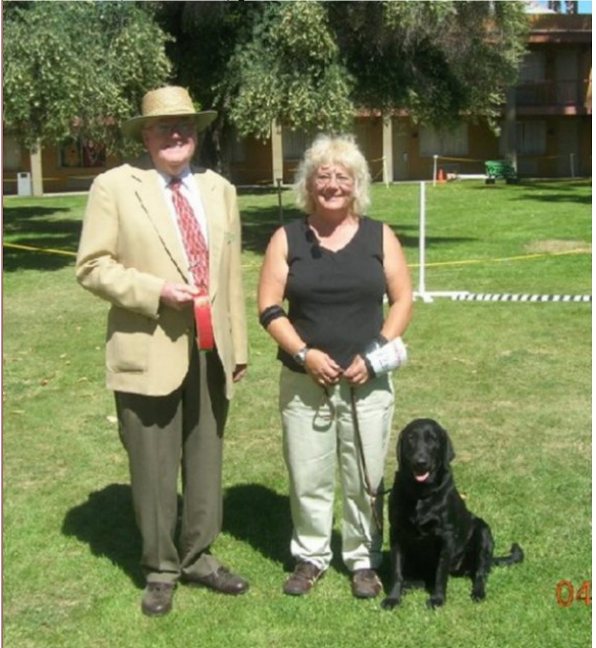
Sundancer's Tabsamanian Girl CD, CGC, pictured above