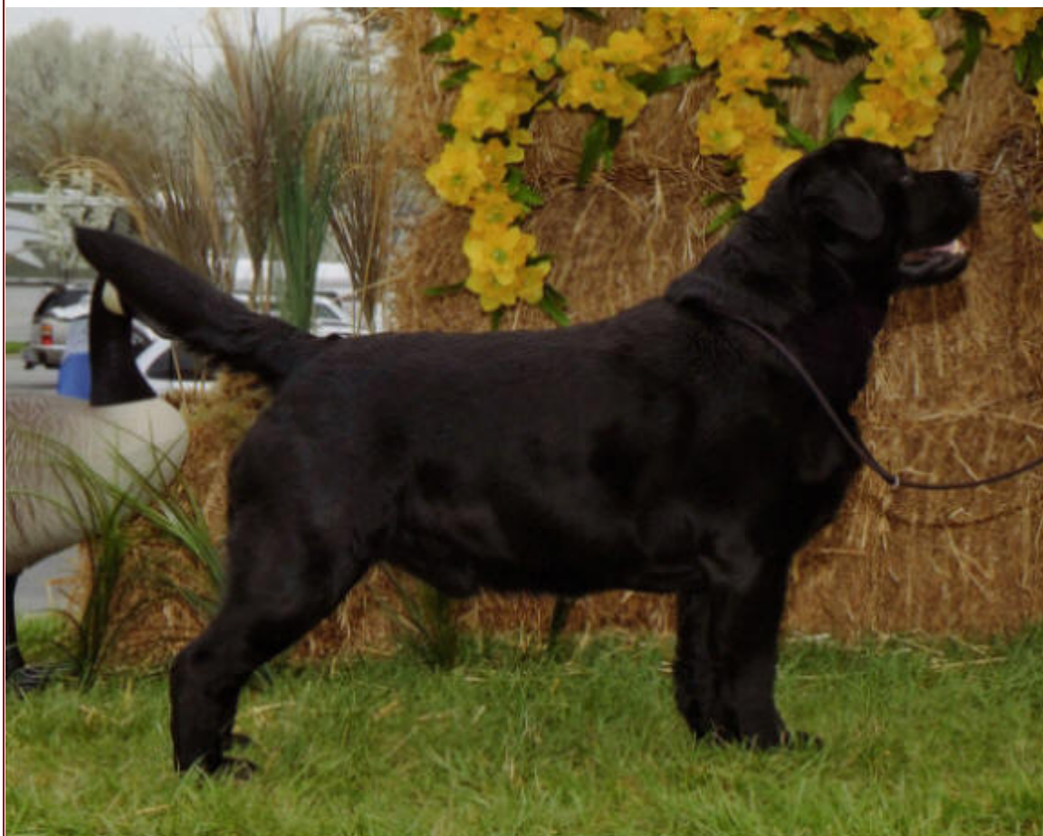
BISS CH. Big Skys Stone Kutter (Mason), pictured above