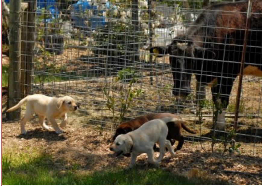
Yellow and Chocolate puppies meeting the 4-H cow!