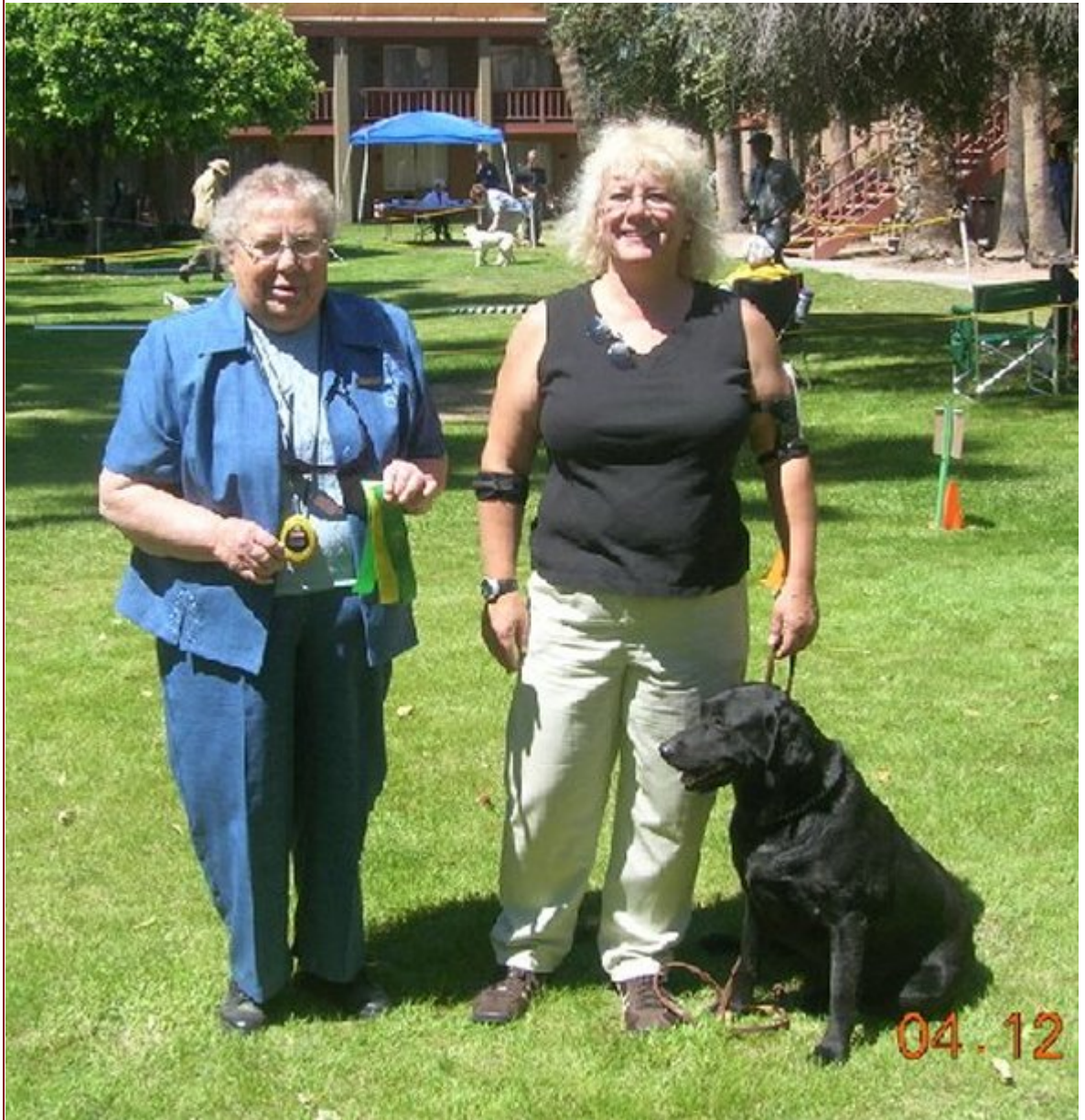
RSK Sundancer's Cinder-Ella Mae CD, RN, CGC, pictured above